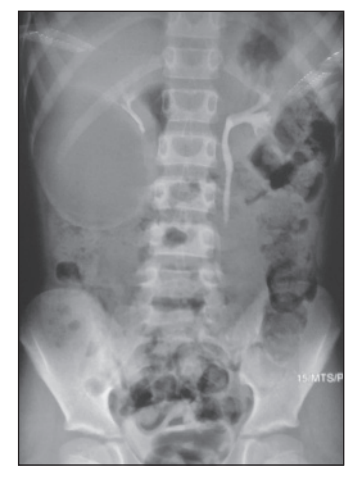
Figure 2: Intravenous urogram (IVU) revealed a space-occupying lesion involving mid and lower pole of right kidney causing displacement of collecting system superiorly

Arif Hussain Sarmast: Substantial contributions to the conception or design of the work; or the acquisition, analysis, or interpretation of data for the work. Afak Yusuf Sherwani: Drafting the work or revising it critically for important intellectual content. Sajad Ahmed Dangroo: Substantial contributions to the conception or design of the work; or the acquisition, analysis, or interpretation of data for the work; and drafting the work or revising it critically for important intellectual content. Mohd. Saleem