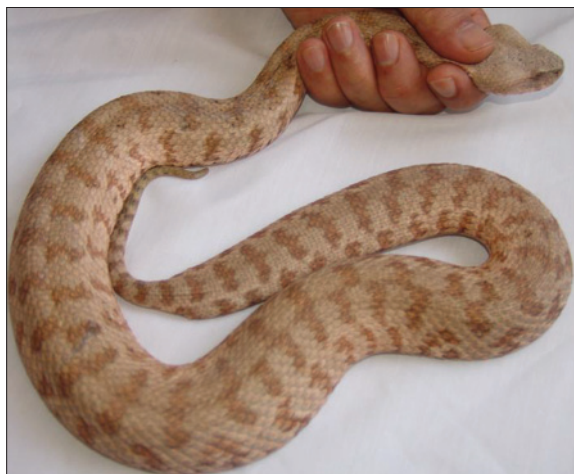
Figure 1: Macrovipera lebetina obtusa