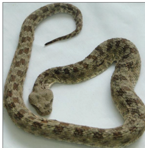
Figure 2: Pseudocerastes persicus