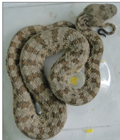
Figure 3b: Pseudocerastes fieldi