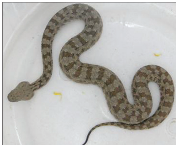
Figure 3a: Pseudocerastes persicus