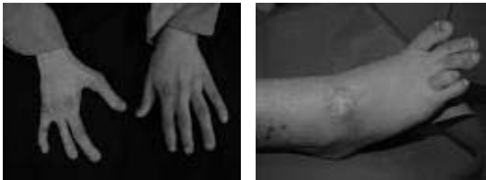
Figure 5. Abnormality of fingers.