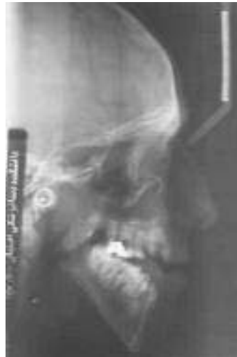
Figure 4. Short rami and flat mid-face.