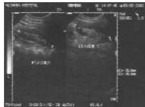
Figure 6. Normal kidneys in sonogram.