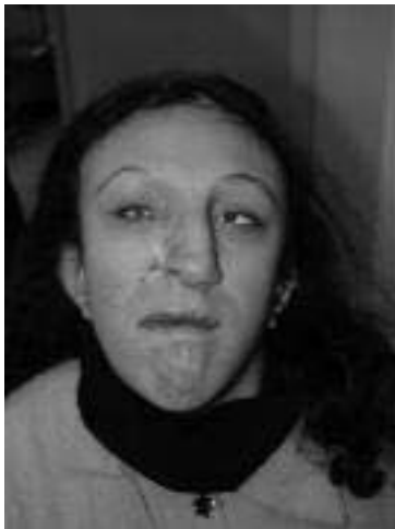
Figure 1. In full face view, we see asymmetric face and hypertelorism, corrected pseudo cleft of upper lip and scar of surgical milia removal.

Authors would like to express special thanks to Behnaz Ebadian, Bijan Movahedian, Navid Askari and Majid Heidarpoor for their sincere cooperation.