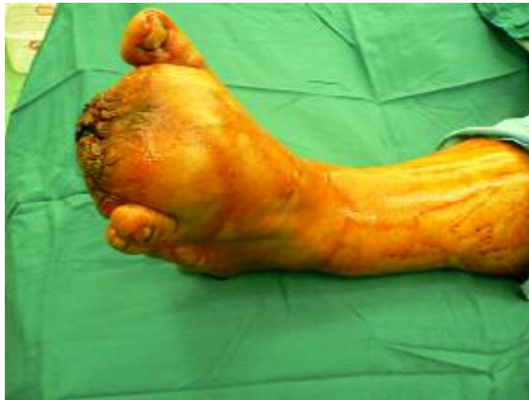
Figure 1. Clinical appearance of dorsum of foot and ankle of the patient before operation.

white-gray cut surface (figure 3). Microscopically, the mass was characterized by an admixture of atrophied nerve fascicles and fibrofatty tissue proliferation with thick collagen bundles (figures 4 and 5). Considering all of the clinical, surgical and pathological findings, our final diagnosis was fibrolipomatous hamartoma of nerve, also known as neural fibrolipoma. Follow up of the patient five months after the operation has not shown any recurrence.