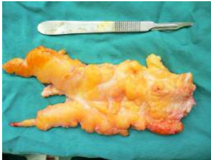
Figure 3. Gross features of the lesion showing a mass with rather soft consistency and yellow to white-gray color.