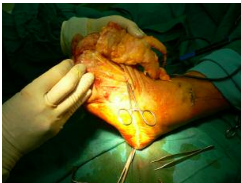
Figure 2. The mass as revealed at surgery.