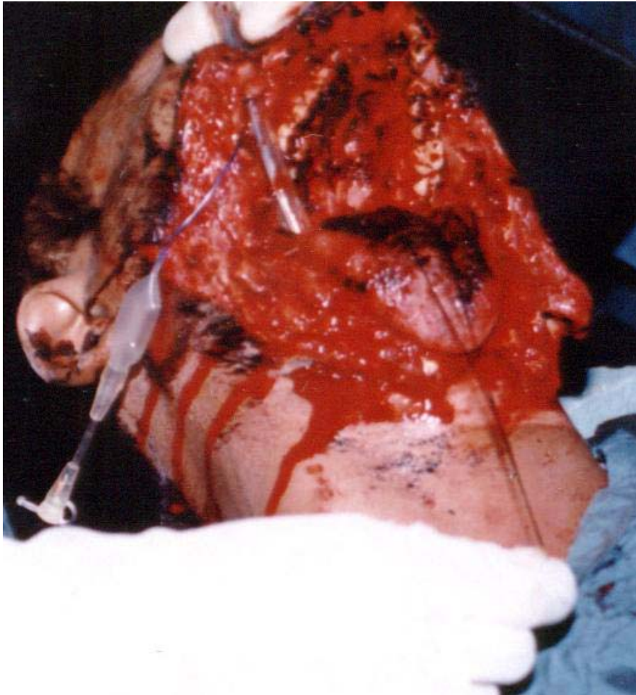
Figure 2. Pulling of the ends of the mattress suture to aid laryngoscopy and intubation