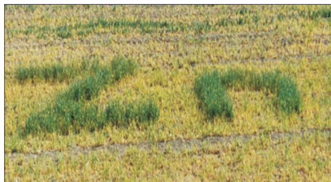
Figure 2: Effect of foliar applied zinc on growth of barley plants in Central Anatolia [106]

Recent studies also indicate that intercropping systems contribute to grain zinc and iron concentrations. Various field tests in China with peanut/maize and chickpea/wheat intercropping systems showed that gramineaceous species are highly beneficial in biofortifying dicots with micronutrients. In the case of chickpea/wheat intercropping, zinc concentration of the wheat grains was 2.8-fold higher than those of wheat under mono-cropping. [108] In many wheat-cultivated countries, continuous wheat cropping is a widely used cropping system. Inclusion of legumes in the crop rotation system may contribute to grain concentrations