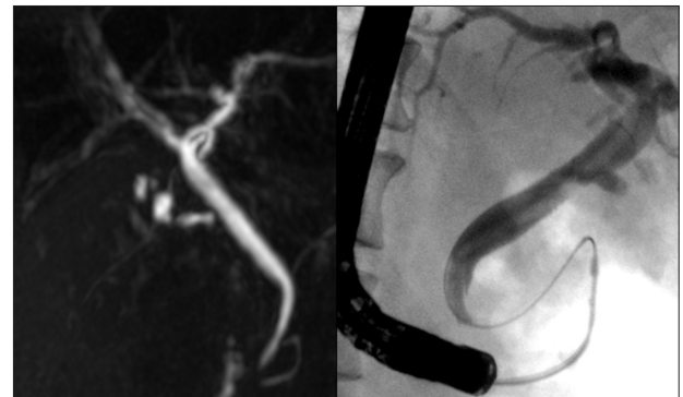
Figure 1: MRCP (left panel) showing no definite evidence of a filling defect in the bile duct, while ERCP done within a two-day interval revealed a linear filling defect (right panel) within the common bile duct, suggestive of a worm

Department of Hepatology, Institute of Liver and Biliary Sciences (ILBS), New Delhi, India