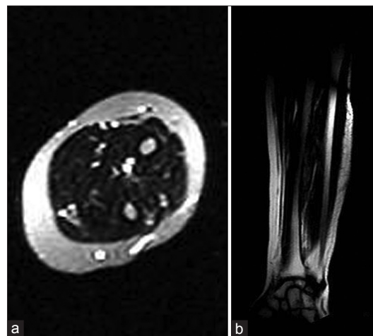
Figure 2: (a) Axial T1-weighted and (b) coronal T2-weighted magnetic resonance images after three months show no abnormalities