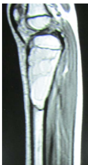
Figure 3. Sagittal view shows expansile centric, septated cystic lesion

The patient was admitted to orthopedics ward for open biopsy. Macroscopically, there was blood accompanied by epithelial lining without straw fluid or infective discharge. Histological examination revealed highly vascular thin membranous lining composed primarily of epithelium-like cells and giant cells accompanied with hemosiderin deposition (Figure.4).