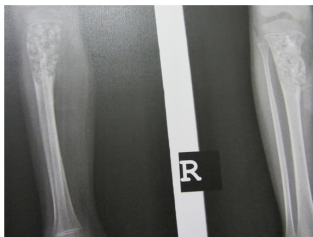
Figure 5. Curettage of lesion grafted with bone substitute

After confirmation of the diagnosis, the patient underwent curettage and grafted with bone substitute (Figure 5). The risk of progressive valgus deformity discussed with patient's parents thoroughly before proceeding with surgery and they were justified to be followed and evaluated postoperatively. At 3 months follow-up, the patient was asymptomatic and clinical examination was normal. The patient was able to walk without limping and pain.