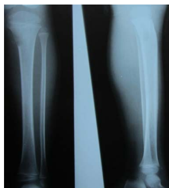
Figure 1. First presentation with small eccentric lucent lesion

Before referring to our clinic, she had been visited 3 months ago by an orthopedic surgeon, and a plain radiography had been requested. At that time, the plain radiography of the right knee demonstrated a small well-circumscribed eccentric lesion in the proximal medial metaphyseal region of the tibia without disruption of the cortex (Figure 1), and the patient had been treated conservatively with suspicious of fibrous cortical defect.