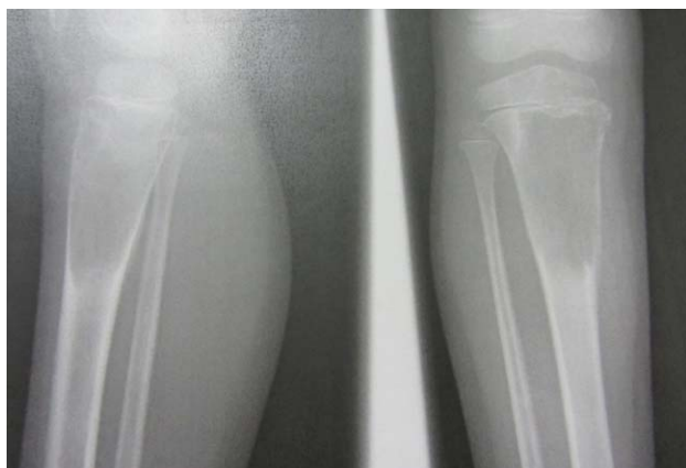
Figure 2. Rapid expansion of lesion after three months

3 months later she was referred to our clinic with a new plain radiography, which demonstrated a large well-defined centric lytic lesion with involvement of both medial and lateral portion of proximal tibial metaphysis, without disruption of cortices and physis (Figure 2). There was no evidence of fallen leaf sign or obvious sclerotic border. Furthermore, there was no obvious septation but to some extent cortical expansion. Because of rapid progression of the lytic lesion, a magnetic resonance imaging (MRI) was requested. MRI reported an expansile centric, septated cystic lesion in metadiaphyseal part of the right tibia without fracture or secondary changes in muscular component (Figure 3). Signal of lesion was high on T2-weighted and low on T1-weighted.