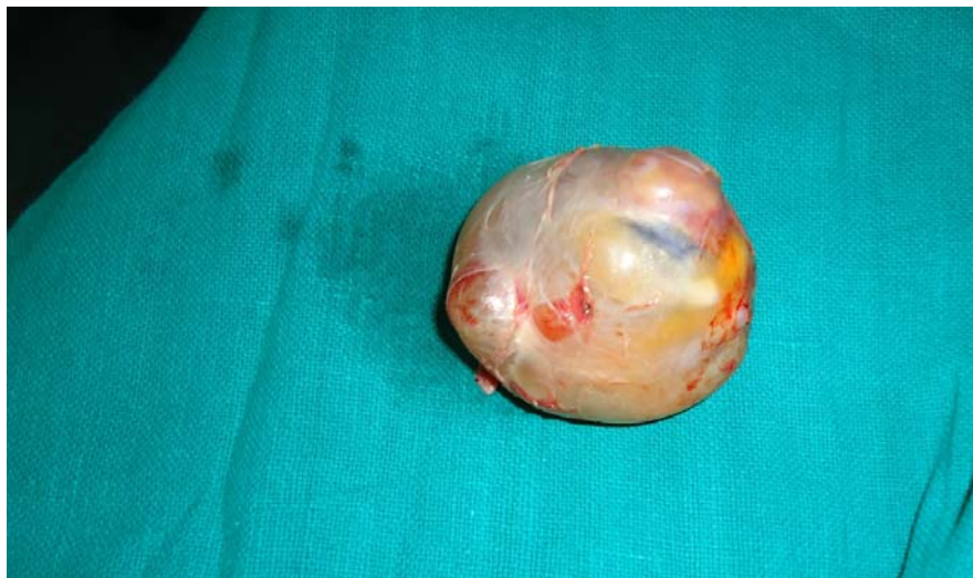
Figure 3. Fetus in fetu