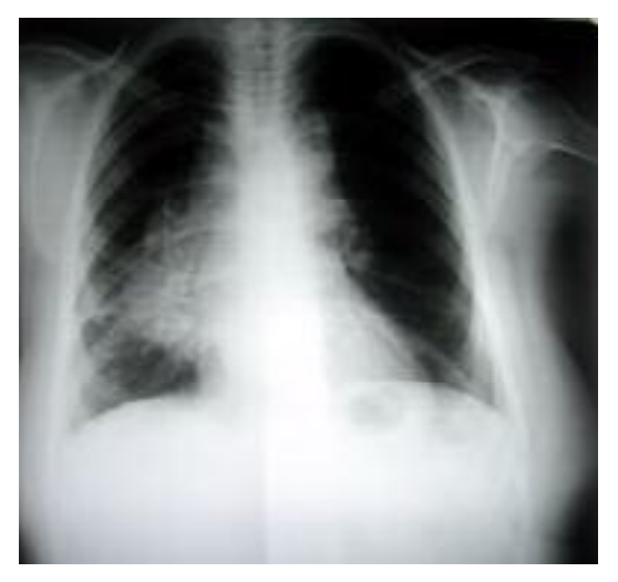
Figure 1. Chest X-ray showing multiple mediastinal lymph nodes.

constitutional symptoms. Chest X-ray showed mediastinal widening and multiple mediastinal lymph nodes (figure 1). In spiral CT of the thorax the lungs were free and multiple large mediastinal and hilar lymph nodes were seen especially in the right side (figure 2). Bronchoscopy findings included left main bronchus bulging with normal mucosal pattern (extrabronchial mass effect). Alveolar washing