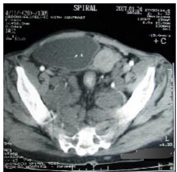
Figure 6. Neurofibromas and ovarian cyst