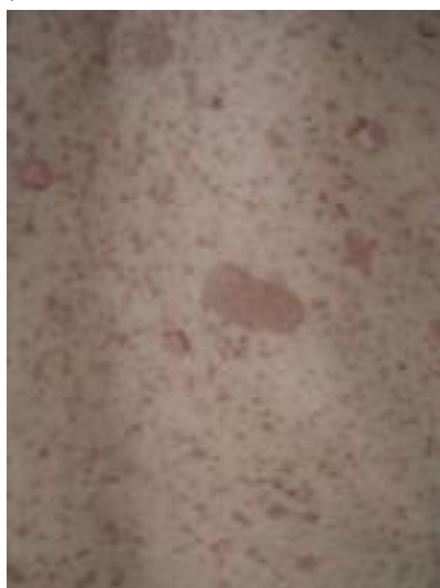
Figure 1. Skin lesions

The patient was a middle-aged woman, ill appearing and cachectic. Her vital signs were stable. Physical findings on examination of heart and lung were normal. Abdomen was soft and on superficial palpation, a plenty of freely movable, soft, and non-tender subcutaneous and intradermal nodules of varying sizes were detected. She had left lower quadrant tenderness. On skin examination, there were widely distributed freckles and hyperpigmented macula and patches with sharp border of variable sizes (Figure 1). The hyperpigmented brown patches were mostly seen on abdominal and lumbosacral areas. Extraintestinal manifestations related to IBD were not detected.