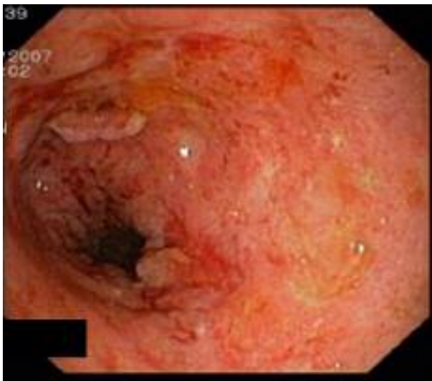
Figure 2. Colonoscopic view of rectum

within psoas muscles, which were sharply margined and homogenous, with water attenuation. Also, a few subcutaneous neurofibromas were present on right flank (Figure 5). More Caudal CT scan showed bilateral presacral and nerve root foraminal Neurofibroma, mildly expanding the sacral foramina, as well as pelvic masses of neurofibromatosis displacing the rectum and uterus anteriorly. Incidentally, a large right ovarian cyst was also detected (Figure 6).