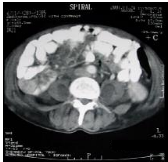
Figure 5. Bilateral psoas muscle neurofibroma