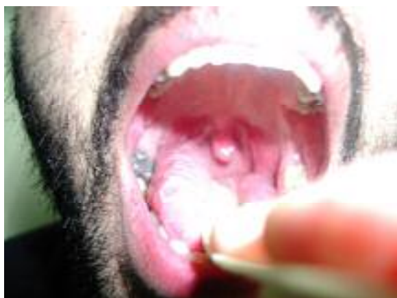
Figure 1. Paralysis of right IX and X cranial nerves.

was normal and after symptomatic treatment, he recovered. Family history for multiple sclerosis or laryngeal diseases was absent.