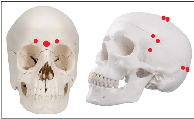
Figure 2: Locations of botulinum toxin injection for chronic migraine headache

Our data also showed that the frequency of headaches, their duration and intensity and the mean HIT score of all patients improved significantly within 3 months after interventions (all P < 0.05 ). A comparison of both groups showed no significant differences among them regarding the mentioned variables [Table 3].