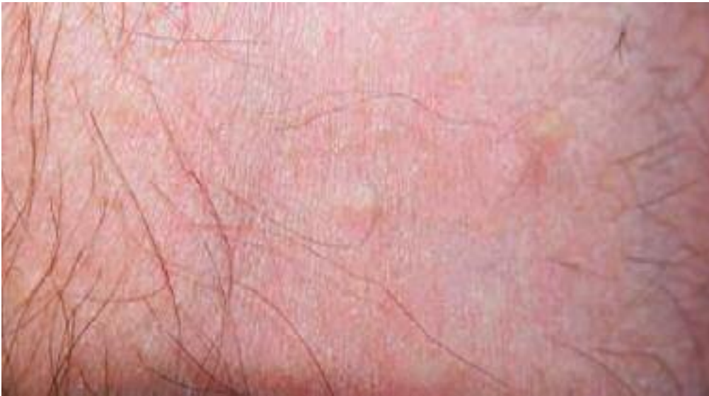
Figure 1. Multiple 2-3 mm subcutaneous lesions that were mobile and had yellowish distinct were observed on the forearm of the patient.