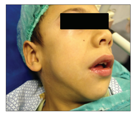
Figure 2: Swelling of right parotid gland