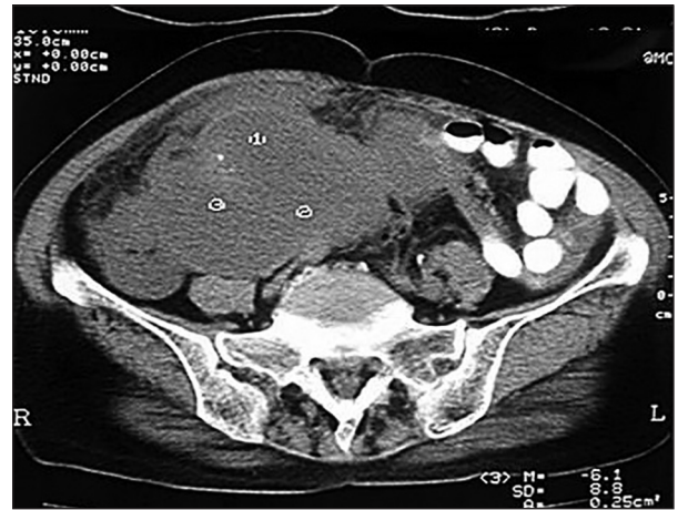
Figure 1: Computed tomography revealed a large cystic mass with irregular margins measuring 8.6 cm × 7.5 cm × 6.2 cm in the right lower abdominal cavity

The patient was then scheduled for a second operation and underwent a right hemicolectomy, which is proposed as the treatment of choice for this type of neoplasms. There was no evidence of synchronous ovarian tumor, but in order to avoid the risk of recurrence and given the age of the patient, bilateral oophorectomy was performed. No metastases were observed during the hospitalization and surveillance of 1-year. The colonoscopy and CT scan were performed 1-year later and did not reveal any malignant tumor.