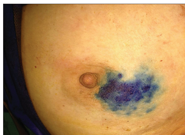
Figure 3: Blue tattooing of the skin after methylene blue dye injection