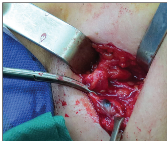
Figure 1: An intraoperative picture of sentinel lymph node surgery in axilla that shows a blue node colored with methylene blue dye

We performed the biopsy in two hospitals, so we had two radioactivity detectors. The gamma-probe (navigator)