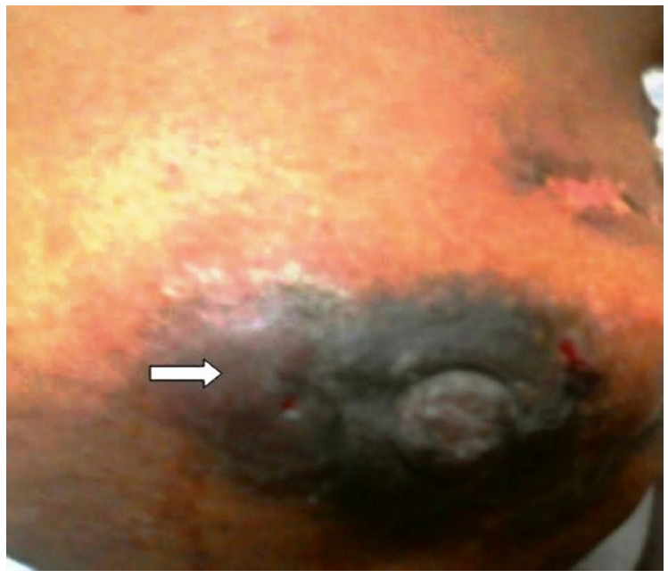
Figure 1. Breast with multiple sinuses

failure was considered as relapse case restarted category II treatment under DOTS (Directly Observed Treatment Short Course). On three months follow-up, lymph node enlargement had regressed and abscess was resolved, though there was recurrence of small abscess after 1 month. Finally, she completed the treatment and was cured of TB infection.